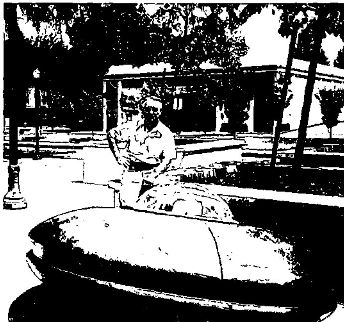
PAUL C. CERNY UFO Crash in Mountain View in Civic Center (California)

August 14 & 15 — International UFO Conference, "UFOs: Fact, Fraud or Fantasy." Sheffield Polytechnic, Main Building on Pond Street in Sheffield, So. Yorkshire, England. For information please contact Independent UFO Network, 1 Woodhall Drive, Battley, West Yorkshire, England WF17 7SW.